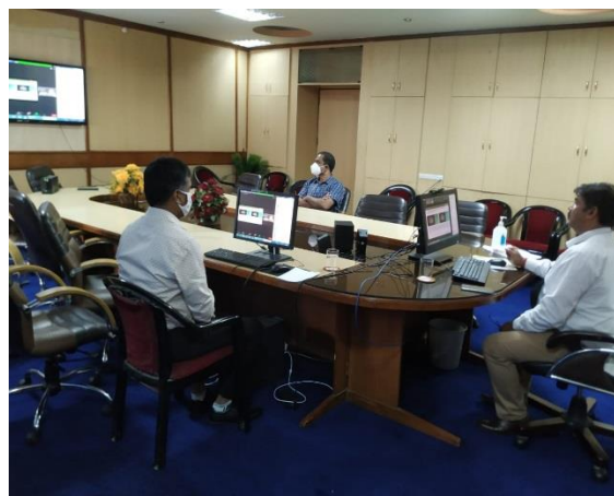
Glimpses of Webinar held on 10.09.2020